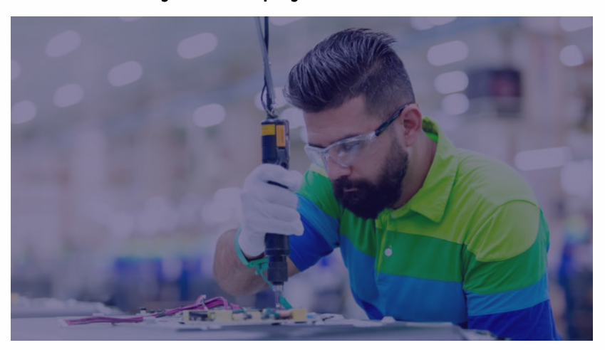
*Limits are not guaranteed and are subject to change

WTFP helps address business productivity and competitiveness by providing resources to Massachusetts businesses to fund training for current and newly hired employees.